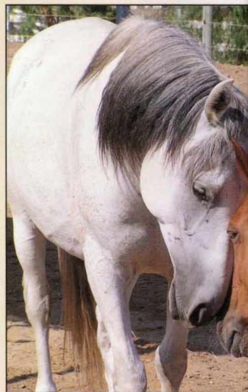
Storm and Rusty showed almost identical HRV patterns, raising the question of whether horses, when interacting with humans, could indicate their sentient nature.

We found that when humans projected a positive emotional state to the horse, a frequency spike appeared in the person's HRV of about 0.1 cycles/second. This means that when people experience positive emotions their heart rate cycles up and down regularly every 10 seconds. This gives us a way of measuring whether a person is effectively projecting positive emotions or not. Interestingly, the HRV frequencies specific to that horse showed up in all but one of the human subjects' HRV. It appeared that each person synchronized his or her particular HRV frequency cycle to